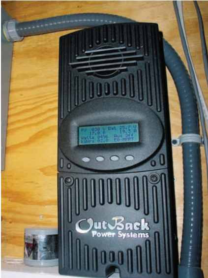
Step-down MPPT controllers can help decrease wiring costs by allowing PV array voltage to be higher than the battery bank voltage.

reliably and efficiently—and that will produce, on average, the expected amount of energy required. In other words, it is the designer’s job to give the system manager/homeowner a realistic idea of what to expect.