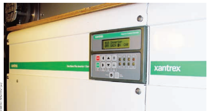
Khanti Munro (2)

Select an inverter to handle the maximum loads that will be on at once in the home. Choosing the next larger size will help ensure your system can meet the demands of future loads.