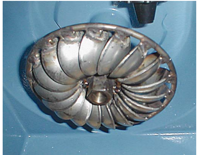
Shown from beneath—the 4-inch (10 cm) turgo runner in an Australian-made Platypus turbine.

A type of impulse hydro runner optimized for lower heads and higher volumes than a Pelton runner.