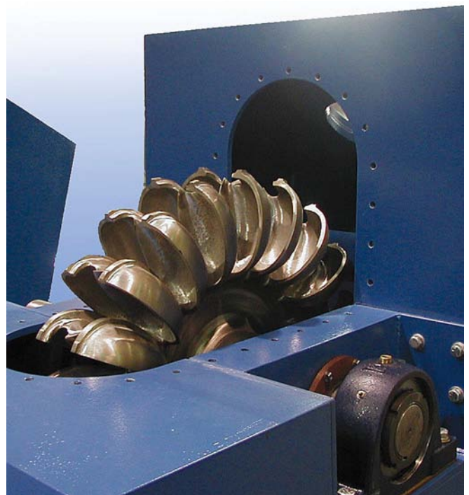
A view into a turbine shows a relatively large (2 feet in diameter) Pelton wheel. Peltons vary in size from 3 inches to 13 feet or more, depending on head and flow.

with rectifiers, are typically used with small household systems, and are usually augmented with batteries for reserve capacity, as well as inverters for converting the electricity into the AC required by most appliances. DC generators are available in a variety of voltages and power outputs.