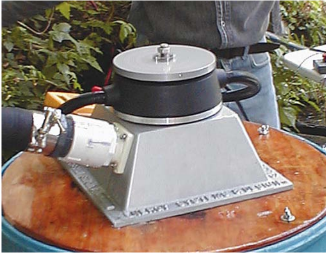
A Canadian-made Energy Systems and Design turbine uses a permanent magnet alternator and a turgo runner.

battery voltage at the desired level while maintaining a constant load on the generator.