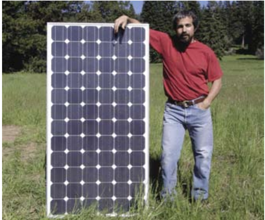
A Sharp 175-watt solar-electric module, 62 x 32.5 inches. The author, 66.25 x 18.5 inches.