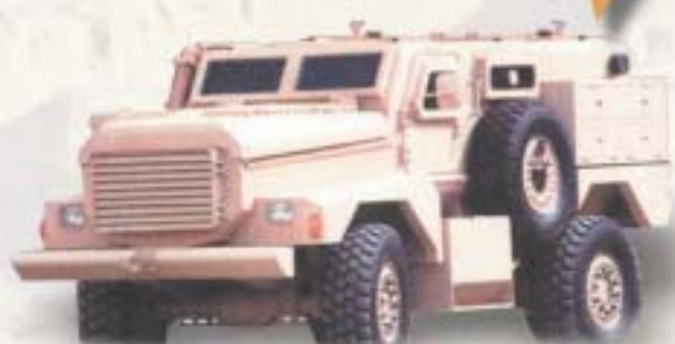
Cougar Force Protection