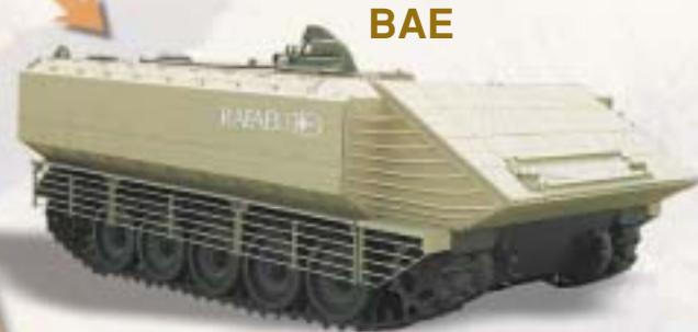
M113 APC BAE