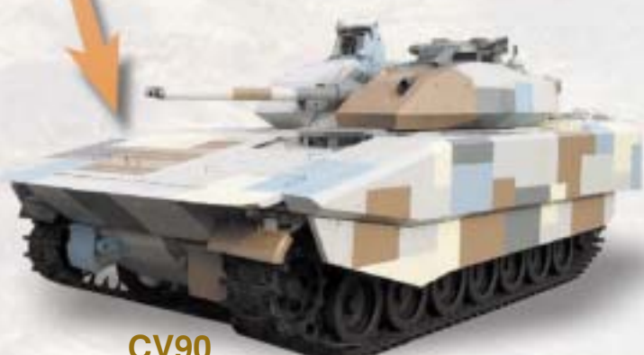
CV90 BAE Hägglunds